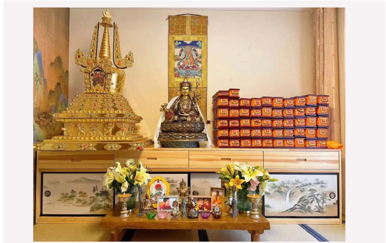
Temporary Placement for the Golden Stupa, Statue and Texts in Li-Jiang, China

At this time, it seems important to buy this land to build a Memorial so we are not paying rent year after year.”